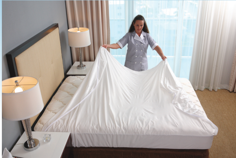
Opens Fully On 3 Sides For Easier Installation And Removal